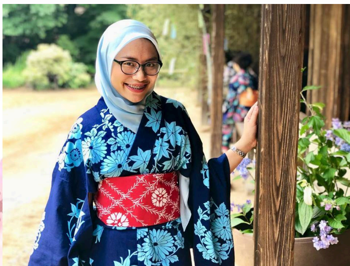
Went to Yukata's Program held by Kanagawa SGG Club