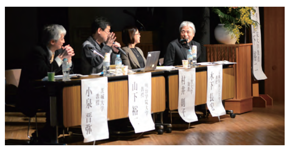
Panel Discussion Part 1

YNU students and local citizens attended the symposium and listened eagerly to keynote lectures and panel discussions.