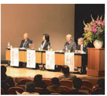
Panel Discussion Part 2

Website(Eng): http://www.ynu.ac.jp/hus/kokusais/9150/detail.html