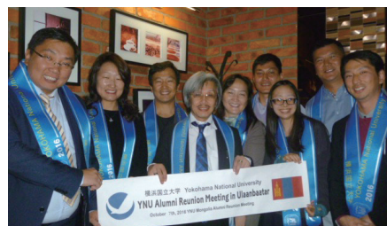
2016 YNU Mongolia Alumni meeting group photo

For details see: http://www.ynu.ac.jp/hus/alumni/16889/detail.html