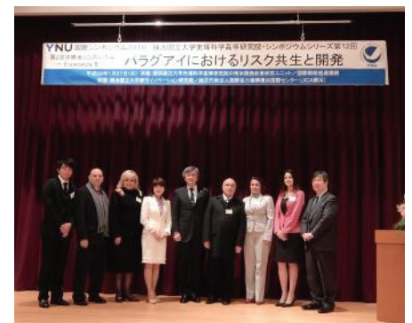
Commemorative photo of all lecturers