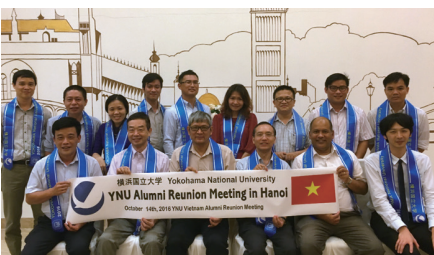
2016 YNU Vietnam Alumni meeting group photo

For details see: http://www.ynu.ac.jp/hus/alumni/17011/detail.html