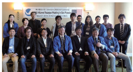
2016 USA West Coast Alumni meeting group photo

For details see: http://www.ynu.ac.jp/hus/alumni/15629/detail.html