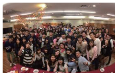
Students enjoying the Welcome Party

dents and approximately 180 Japanese students enjoyed founding international friendships and joining activities such as Japanese calligraphy and a Bingo game.