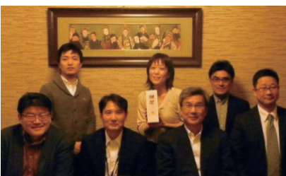
2016 YNU Moscow Alumni meeting group photo

For details see: http://www.ynu.ac.jp/hus/alumni/15700/detail.html