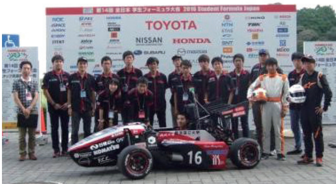
YNFP member's group photo

tomobile Manufacturers Association) Chairman Award.