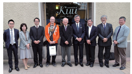
2016 YNU Europe Alumni meeting group photo

For details see: http://www.ynu.ac.jp/hus/alumni/16637/detail.html