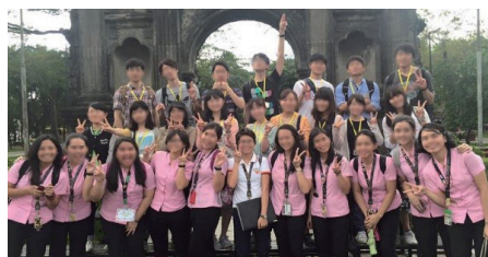
Group photo of students

term Study Abroad Program was held at the University of Santo Tomas in the Philippines. 16 YNU students attended the program.