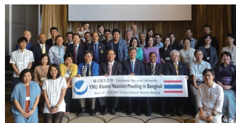
2016 YNU Thailand Alumni meeting group photo

For details see: http://www.ynu.ac.jp/hus/alumni/15630/detail.html