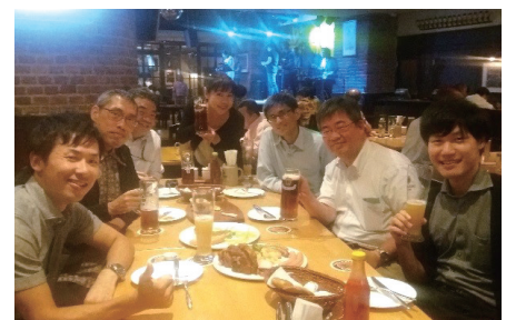
2016 YNU Indonesia Alumni meeting group photo

For details see: http://www.ynu.ac.jp/hus/alumni/17309/detail.html