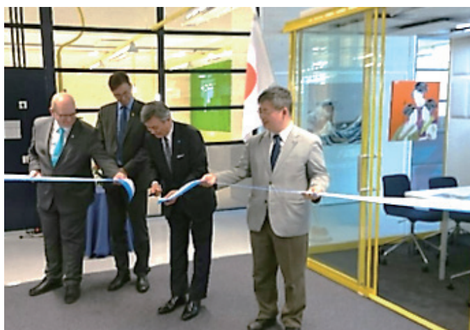
Ribbon cutting by President Hasebe

For details see: http://www.ynu.ac.jp/hus/kokusais/16659/detail.html