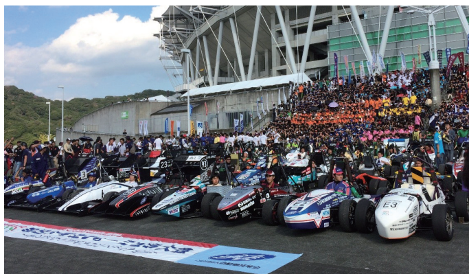
YNU machine (3rd from the right) with other competitors