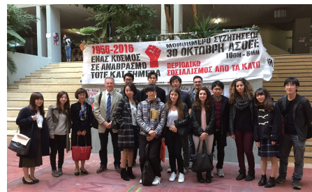
The 11 th Euro-Japan Dialogue at University of Athens

presented on the topics such as University Tuition Fees and Migrant Labor. In Athens, the main topic of discussion was on the economic benefits of a multilingual society. A lively discussion on the role of English in Greek and Japanese societies followed. The Euro-Japan Dialogue was a great success in large part. Thanks to the hard work, organization and gracious hospitality of our European partners at University of Bucharest and University of Athens.