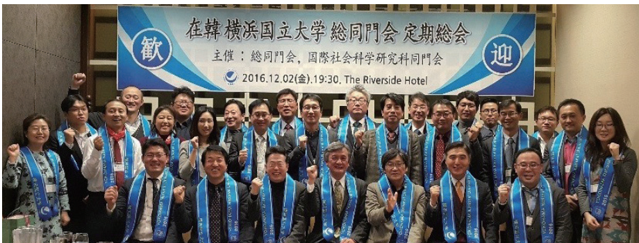
2016 YNU Korea Alumni meeting group photo

For details see: http://www.ynu.ac.jp/hus/alumni/17360/detail.html