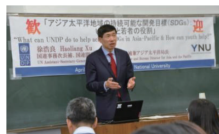
UNDP Director Xu

students, and international students. The lecture was focused on importance of young people's energy to help achieve Sustainable Development Goals (SDGs) with detailed examples. It inspired many of the participants; one of the students commented that he was able to understand SDGs more deeply.