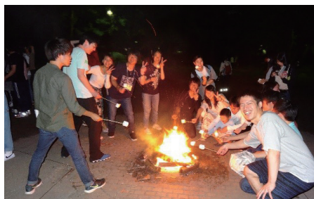
Students beside a campfire

Brazil said, "The Camp was so much fun. Please let me know if I can help in the coming events!" A student from Russia said, "I'm not good at making new friends, but this camp helped me a lot with talking with other participants and getting to know each other."