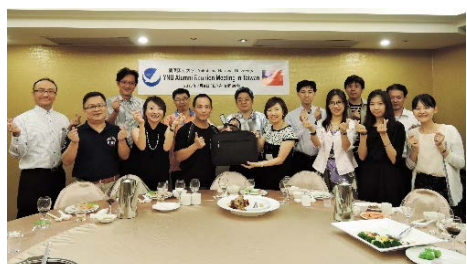
Taiwan Alumni meeting group photo For details see: <a href="http://www.ynu.ac.jp/hus/alumni/18622/detail.html">http://www.ynu.ac.jp/hus/alumni/18622/detail.html</a>